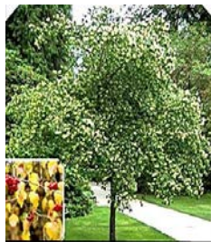
Washington Select Hawthorne 25’ to 30’ Mature Height Tree Habit: Green, Flowering/ Fall Berry Quantity Purchased _____