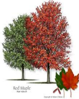
Burgandy Belle Red Maple 2” 35’ to 50’ Mature Height Tree Habit: Dark Green/Fall Color Quantity Purchased _____