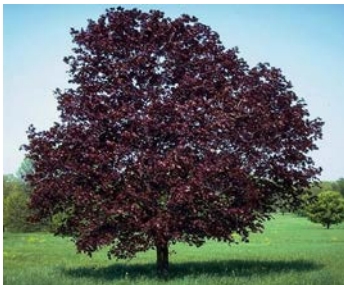
Royal Red Maple 2” 30’ to 40’ Mature Height Tree Habit: Shade, Reddish Bronze Quantity Purchased _____