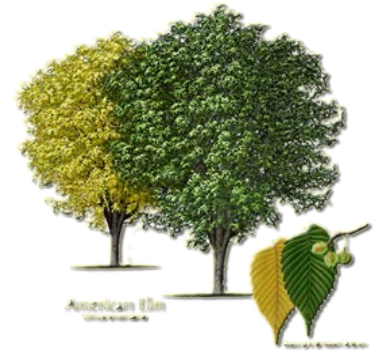
Accolade Elm 2” 40’ to 50’ Mature Height Tree Habit: Fast Growing, Spring Flowers Quantity Purchased _____