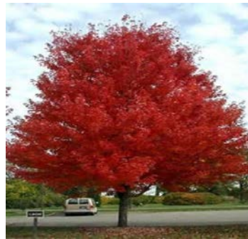
Autumn Blaze Maple 2” 45’ to 50’ Mature Height Tree Habit: Spreading Oval, Fall Color Quantity Purchased _____