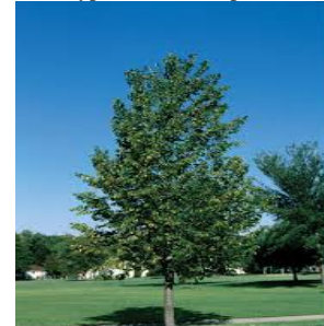
Corinthian Little Leaf Linden 2” 30’ to 50’ Mature Height Tree Habit: Shade, Yellow Fall Color, Fragrant Flower Quantity Purchased _____